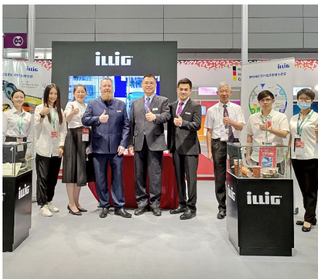
Pic-1: Great success for ILLIG at Chinaplas 2021: Booth staff with thumbs up